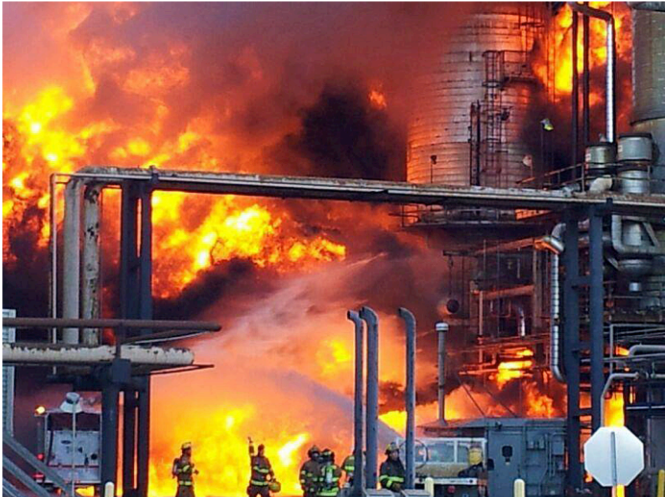
Richmond, Chevron. August 6, 2012

(3) Western Regional Director, U.S. Chemical Safety Board, retired